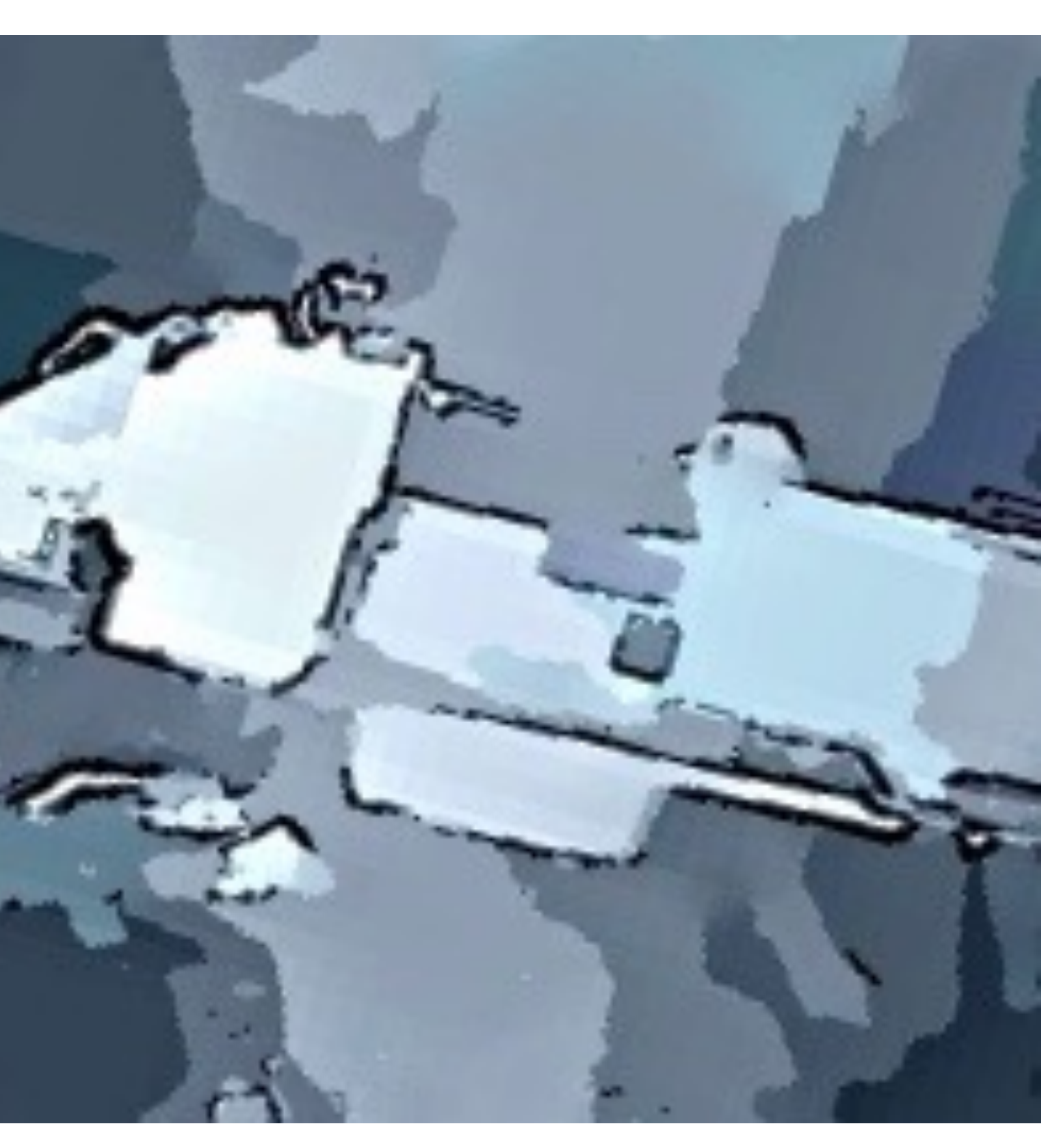
"Some cran probe is the least of our worries right now!"