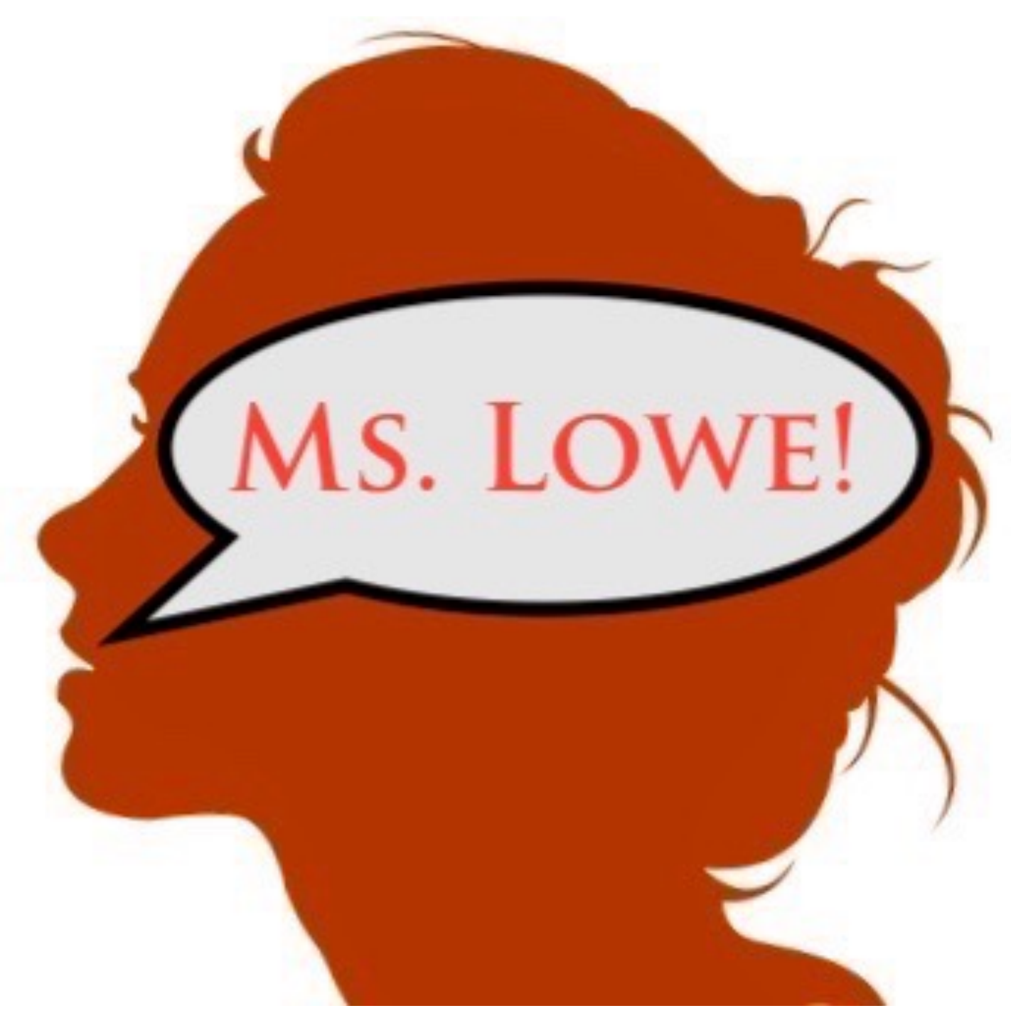
THE MS. LOWE REFRESHMENT COMPANY