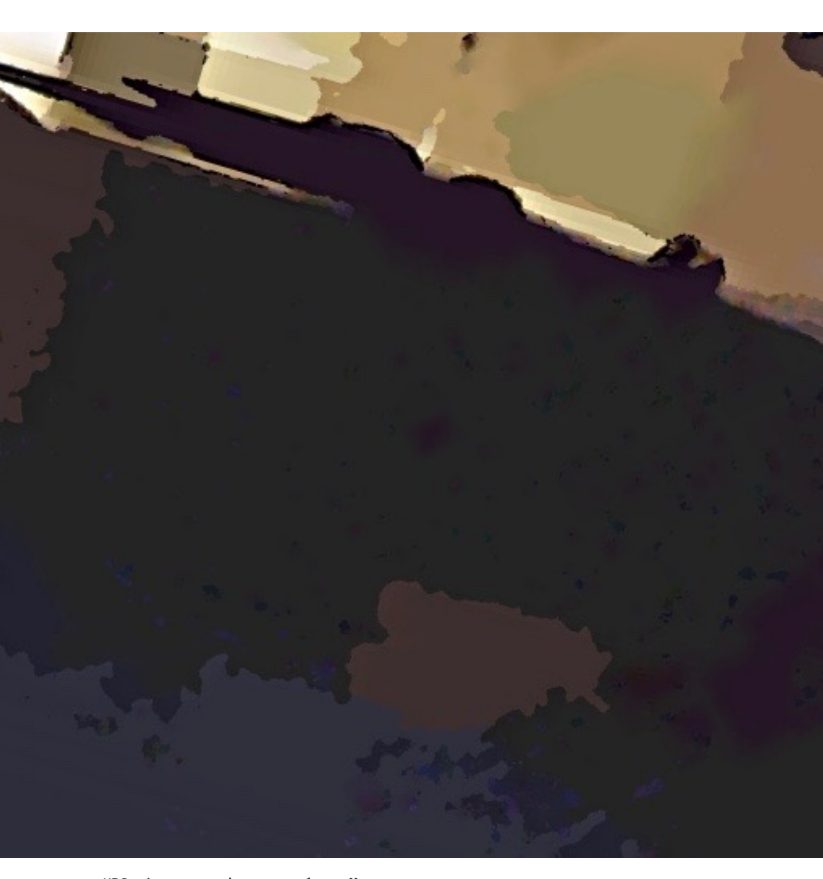
"You're not going anywhere."